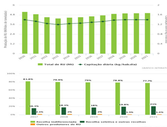
Figure 2 Variation in waste production in mainland Portugal.

These results showed the trend of increasing the production of urban solid waste (RSU) recorded in recent years, contrary to the target of reduction in production, which is ratified in the annual reports of the Portuguese Environment Agency (APA) and summarized in Figure 2, in which can be observed the variation of the total production of RSU in millions of tons and per capita daily generation. In the graph in Figure 2, it can be seen that from 2011 to 2013, there was a decrease in the production of waste and, consequently, a lower per capita waste generation, but from 2014, the recovery of waste production started. The decline was a conjectural consequence of the economic crisis that broke down in Portugal and the intervention of the Troika, with an austerity plan that narrowed the economy and consumption. According to APA, 11 in Continental Portugal, in the period from 2019 to 2021, there was a 1% increase in the production of waste, which was registered at approximately 5,04 million tons of waste, representing an increase of 0.6% compared to 2020, resulting from the resumption of economic growth due to the removal of the restrictions applied in the COVID 19 pandemic. The waste per capita output was 511 kg/hab. year.